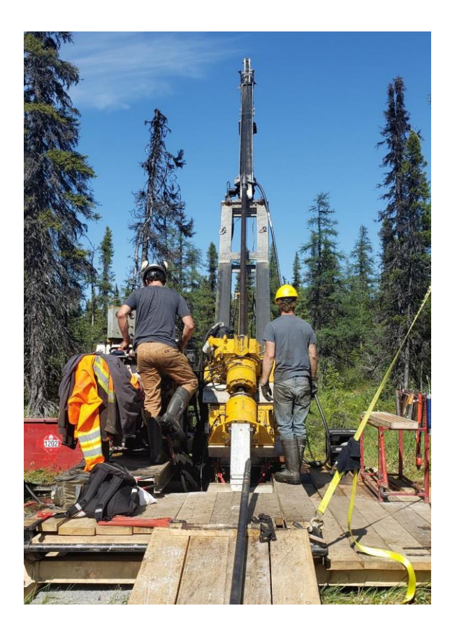
Fig. 1 Drill rig at Mallard Target

July 22, 2021 – Saville Resources Inc. (TSXv: SRE, FSE: SOJ) (the "Company" or "Saville") is pleased to provide an update on its diamond drill program currently underway at its Niobium Claim Group Property (the "Property"), located in northern Quebec. The program is being managed by Dahrouge Geological Consulting Ltd of Edmonton, AB, with drilling operations being carried out by Logan Drilling Ltd of Stewiacke, NS.