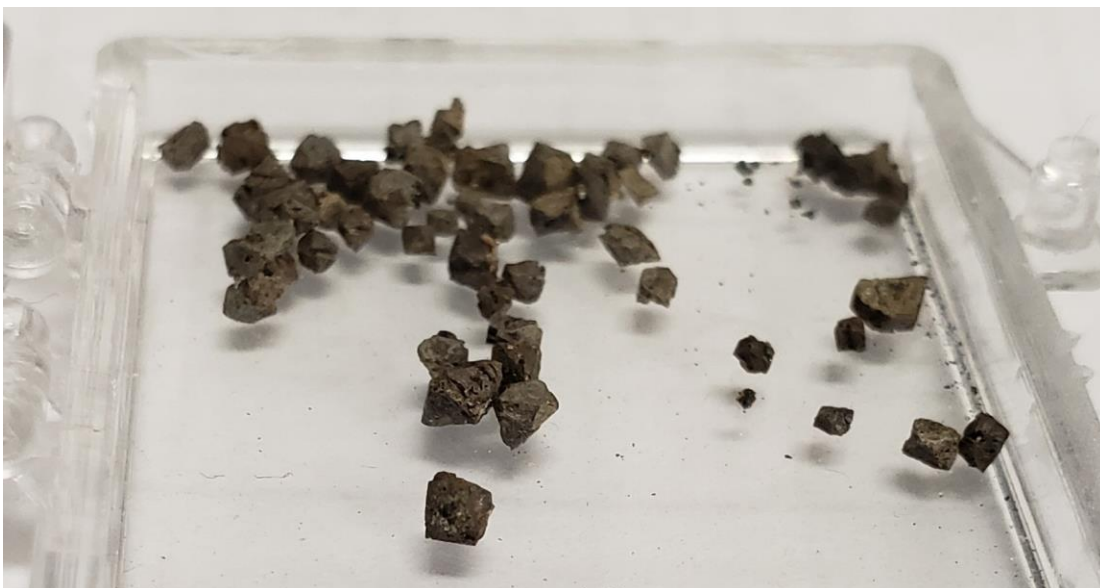
Figure 2: Liberated pyrochlore minerals from HCl leach

In addition to the mineralogical work, as part of the research project at the University of Windsor, a hydrochloric acid (HCl) leach to remove carbonates was completed on a piece of drill core from Mallard in order to recover apatite for oxygen isotope analysis. However, as the pyrochlore mineral is resistant to HCl attack, the test also resulted in the liberation of the pyrochlore (see Figure 2 below). The pyrochlore recovered is of the typical brown colour with an octahedral habit (i.e. a “square bipyramid” shape).